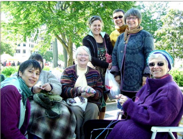
Four women on a knitting retreat from Chicago (Oak Park) stop by to watch our members knit on the square.

I say we knit out every Saturday on the square. Who's with me? I bet those who came and knitted and spun would be game. Despite a little chill (the fingerless gloves came in very handy), we had a blast.