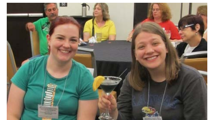
Come for the knitting, stay for the fun!