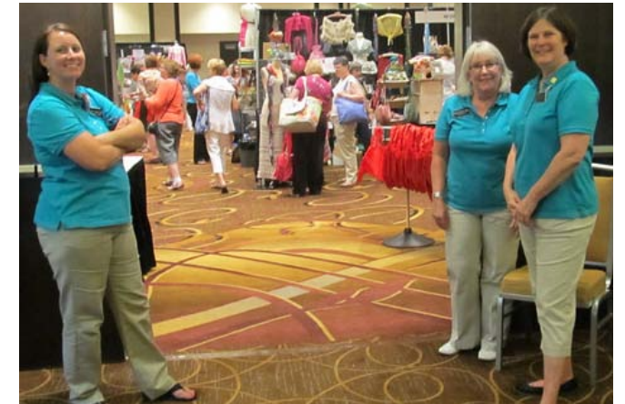
The Show staff welcomes attendees to the Expo.

Photos from the Indianapolis Summer Show are now available to view at TKGA.com/?page=ConferenceHistory . Here's a sneak peek!