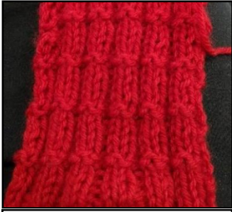
Bamboo Rib stitch: version 1